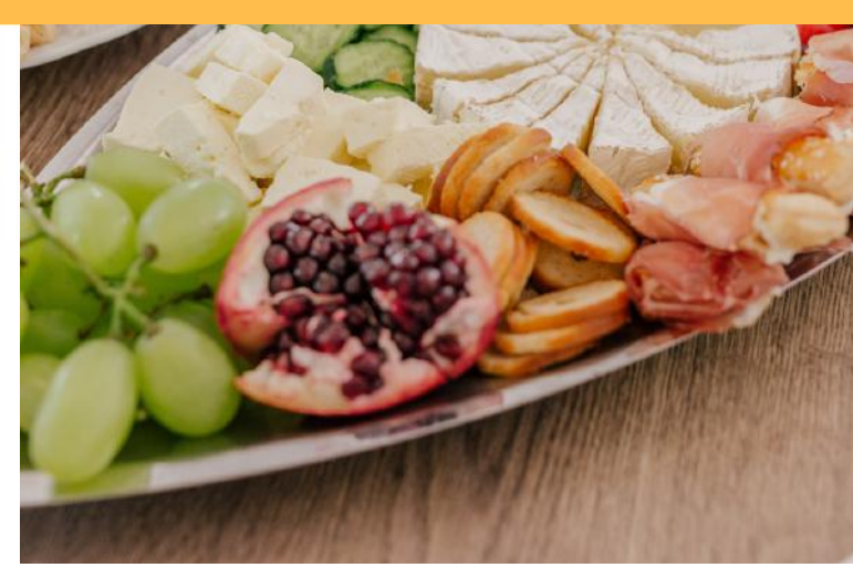
Each platter on average will feed 8-10 people